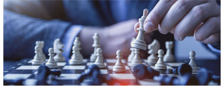
Is It Time to Review your Superannuation Strategy?