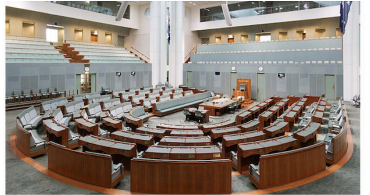
How The 2018-19 Federal Budget May Affect Your Business